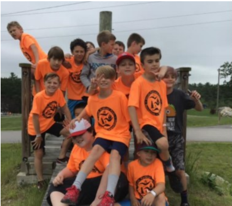
Grades 5-6 Rec Camp