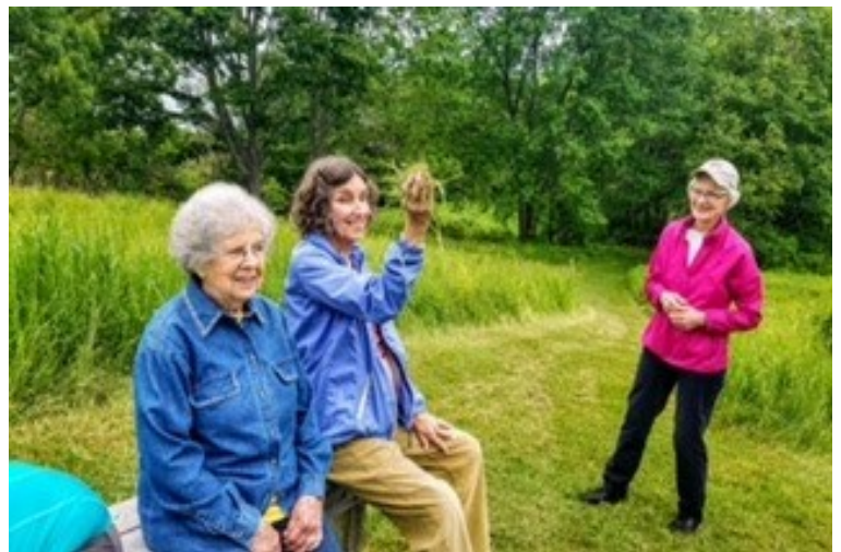
Senior Trip - Maine Audobon Society