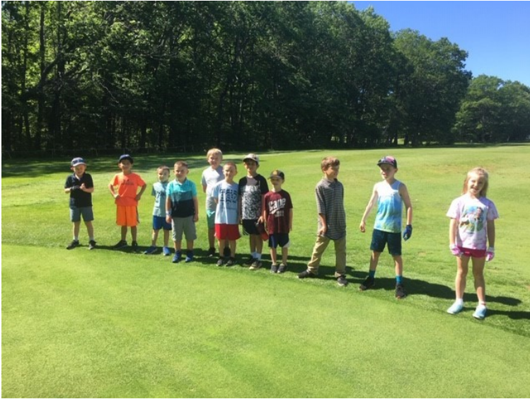
Junior Golf Clinics at South Portland Municipal