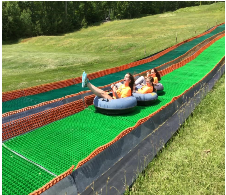
Teen Extreme at Seacoast Fun Park!