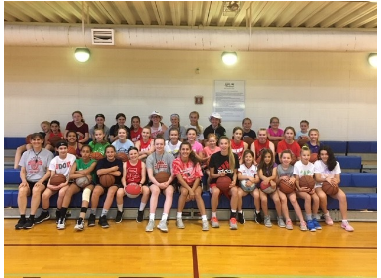
Nothing but Net Girls Basketball Camp at SPCC