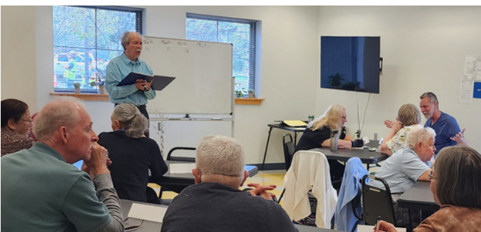
Team Trivia stumps participants