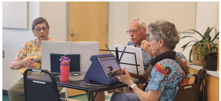
Ukulele practice in the Drop-in Center