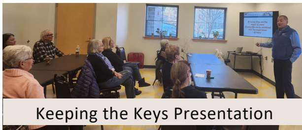
Keeping the Keys Presentation