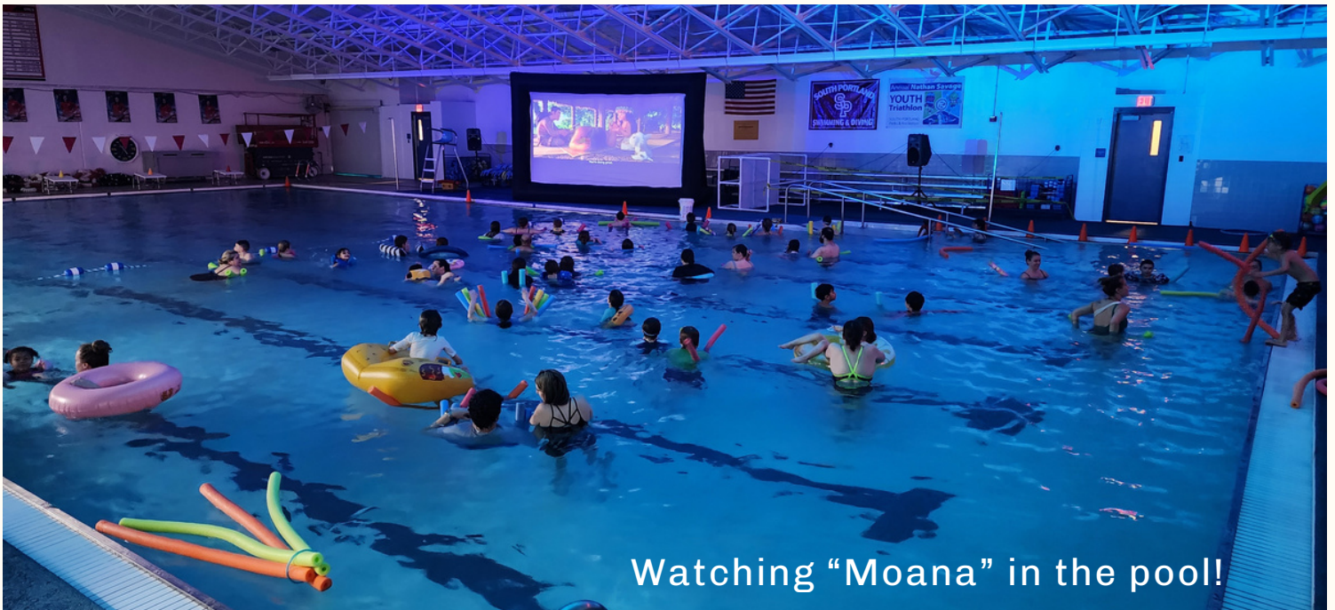
Watching "Moana" in the pool!