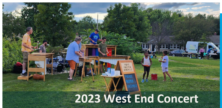
2023 West End Concert