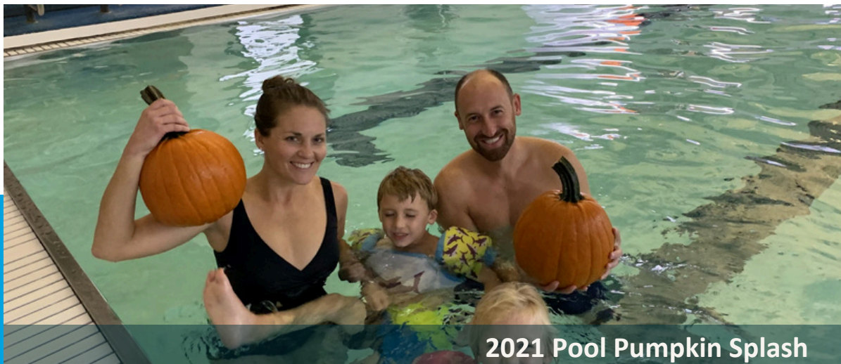
2021 Pool Pumpkin Splash