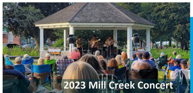
2023 Mill Creek Concert