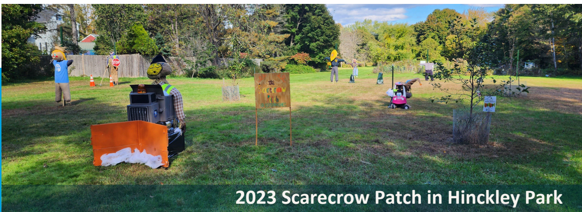
2023 Scarecrow Patch in Hinckley Park