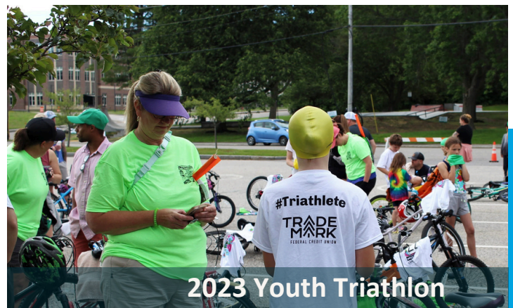
2023 Youth Triathlon