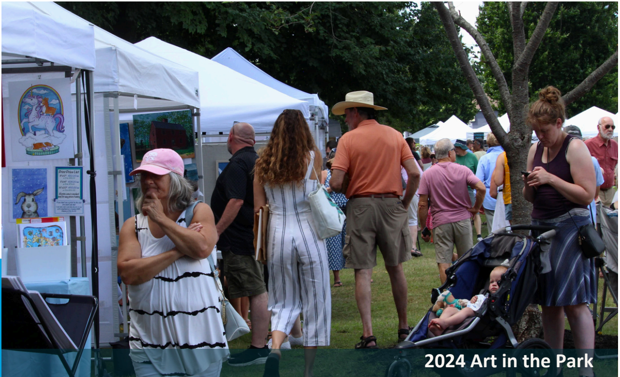
2024 Art in the Park

August 9, 2025 | 170 Artists on display | 10,000+ attendees