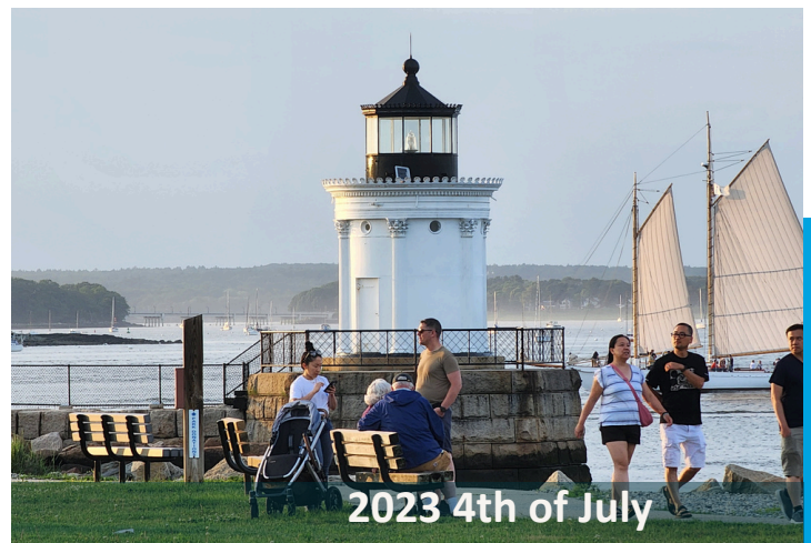
2023 4th of July